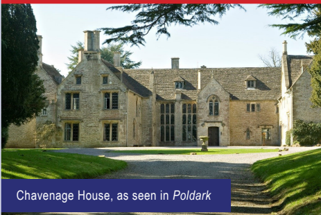
Chavenage House, as seen in Poldark