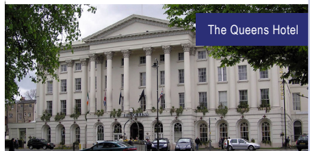
The Queens Hotel