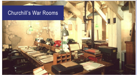
Churchill's War Rooms