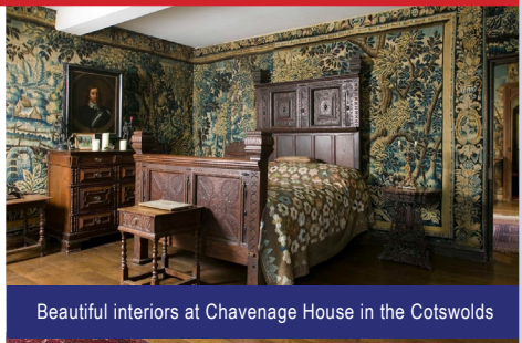
Beautiful interiors at Chavenage House in the Cotswolds