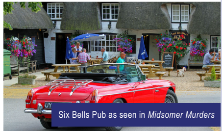
Six Bells Pub as seen in Midsomer Murders

Oxfordshire - Go behind-the-scenes of Midsomer Murders