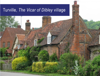
Turville, The Vicar of Dibley village