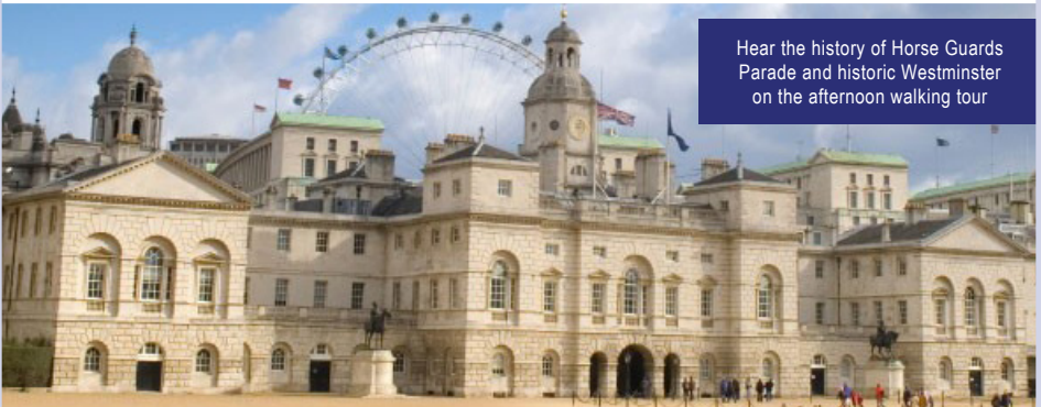
Hear the history of Horse Guards Parade and historic Westminster on the afternoon walking tour